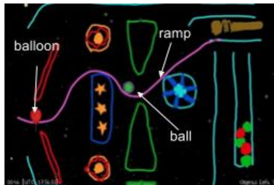
Figure 1. A level in Physics Playground

We validated our competency model in two studies [6]. In Study 1, 11 triads of middle school students (8th-9th graders) played Physics Playground face-to-face for three hours. This is a 2D educational video game that was developed to support and measure students' learning of conceptual physics [7]. It focuses on Newton's laws of force and motion, mass, gravity, potential and kinetic energy, and conservation of momentum. Problems (or levels) in PP require students to guide a green ball to a red balloon. The primary way students move the ball is by creating agents , simple machines of force and motion (i.e., ramps, levers, pendulums, and springboards), drawn with colored lines using the mouse, that "come to life" on the screen. For example, Figure 1 (ultimate pinball level) shows a sample problem where the student must draw a carefully constructed ramp (in purple) to lead the falling ball along a path to the balloon. Students receive silver trophies for any solution to a problem but earn gold trophies for elegant solutions involving a limited number of objects created and used to solve the problem (the threshold varies but is typically < 3 ).